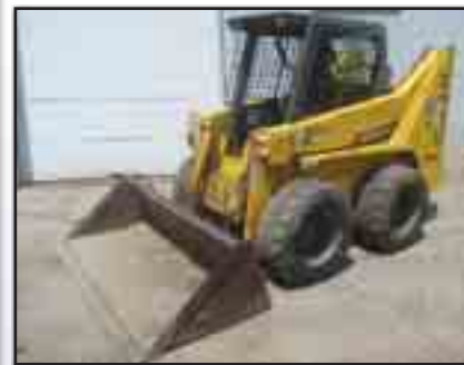
'99 GEHL SL5635DX

1999 GEHL Model SL5635DX Skid Steer Loader , s/n 14428, powered by Deutz diesel engine and hydrostatic transmission, equipped with 72" general purpose loader bucket, manual coupler, high flow hydraulics, ROPS canopy with side screens, and 12-16.5 foam filled tires. In good condition with good tires. (Meter Reads 2,528 Hours)