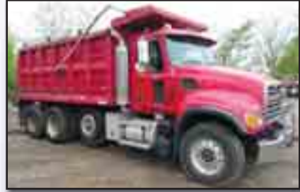
'04 MACK CV713 GRANITE

, powered by Mack (ReMack 4/21) ASET 370, 370HP diesel engine and Maxitorque T310, 10 speed transmission, equipped with Ox Body 16' steel dump body with power tarp and chute, 44,000 lb rears, 18,000 lb front axle, 2-spool plow hydraulics, rear spreader electric, 2-stage engine brake, camelback suspension, aluminum wheels, cruise control, air