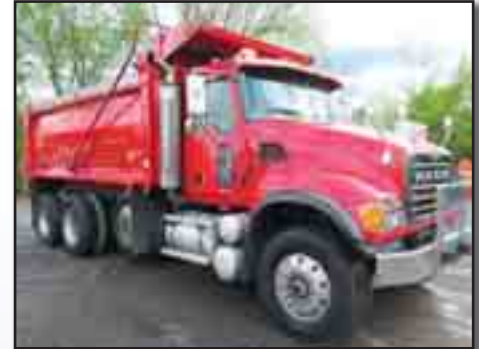
'06 MACK CV713 GRANITE

2004 MACK Model CV713 Granite Tri-Axle Dump Truck , powered by Mack AI-400, 400HP diesel engine and Eaton Fuller 8LL, 10 speed transmission, equipped with J&J 17"6" heated steel dump body with power tarp and chute, 46,000 lb rears, 16,540 lb front axle, 20,000 lb lift axle, 2-spool plow hydraulics, rear spreader electrics, 2-stage engine brake, camelback suspension, aluminum wheels, cruise control, 315/80R22.5 front and lift tires, and 11R24.5 rear tires. In good condition with very good tires. (Odometer Reads 309,543 Miles) (Meter Reads 19,880 Hours) (Unit# CR33)