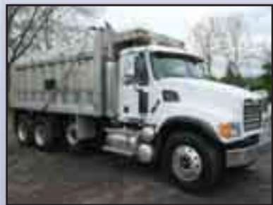
'03 MACK CV713 GRANITE

, powered by Mack E7-460P, 460HP diesel engine and Maxitorque T318L, 18 speed transmission, equipped with J&J 17'6" aluminum dump body with power tarp and chute, 2-stage engine brake, air ride suspension, aluminum wheels, power windows and locks, cruise control, air conditioning, 315/80R22.5 front and lift tires, and 11R24.5 rear tires. In good condition with very good tires. (Odometer Reads 759,427 Miles) (Meter Reads 30,137 Hours) (Unit# CR27)