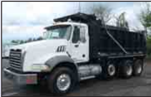
'06 MACK CT713 GRANITE

2006 MACK Model CT713 Granite Tri-Axle Dump Truck , powered by Mack AI-427, 427HP diesel engine and Maxitorque T310, 10 speed transmission, equipped with BiBeau 17"6" heated steel dump body with power tarp and chute, setback front axle, 46,000 lb rears, 16,540 lb front axle, 20,000 lb lift axle, 2-spool plow hydraulics, rear spreader electrics, 2-stage engine brake, camelback suspension, aluminum wheels, cruise control, air conditioning, 315/80R22.5 front and lift tires, and 11R24.5 rear tires. In good condition with good tires. (Odometer Reads 339,305 Miles) (Meter Reads 20,509 Hours) (New Windshields) (Unit# CR41)