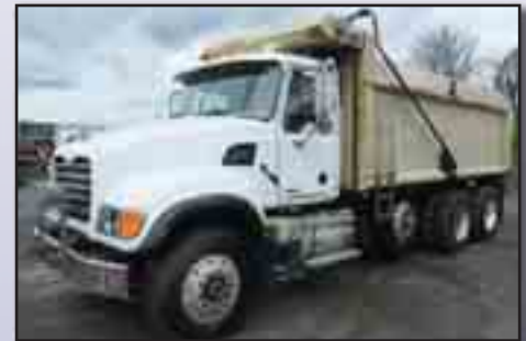
'05 MACK CV713 GRANITE

2005 MACK Model CV713 Granite Tri-Axle Dump Truck , powered by Mack ASET 370, 370HP diesel engine and Maxitorque ES, T310, 10 speed transmission, equipped with 15'6" steel dump body with power tarp and chute, 2-spool plow hydraulics, rear spreader electrics, 2-stage engine brake, camelback suspension, aluminum wheels, cruise control, air conditioning, 315/80R22.5 front and lift tires, and 11R24.5 rear tires. In good condition with very good tires. (Odometer Reads 513,761 Miles) (Meter Reads 25,167 Hours) (Unit# CR30)