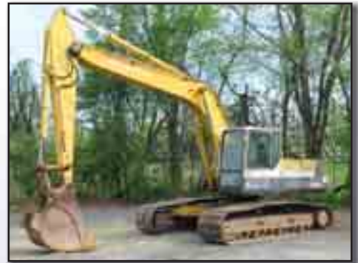
'92 KOMATSU PC220LC

1992 KOMATSU Model PC220LC Hydraulic Excavator , s/n A70507, powered by Komatsu diesel engine and hydraulic drive, equipped with 10' dipper stick with auxiliary hydraulics, 30" digging bucket with (2) ripper pockets, and 31.5" TBG pads. In fair to good