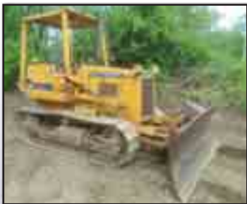
'89 KOMATSU D37E-2

1989 KOMATSU Model D37E-2 Crawler Tractor , s/n A2104, powered by Komatsu diesel engine and powershift transmission, equipped with 6-way blade, rear hitch, and ROPS canopy. In fair to good condition with fair undercarriage. (Meter Reads 4,698 Hours)