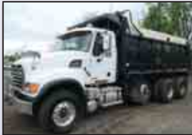
'03 MACK CV713 GRANITE

Tri-Axle Dump Truck , powered by Mack E7-400, 400HP diesel engine and Eaton Fuller 8LL, 10 speed transmission, equipped with Florig 17'6" heated steel dump body with power tarp and (3) chutes, 2-spool plow hydraulics, rear spreader electric, 2-stage engine brake, camelback suspension, aluminum wheels, cruise control, air conditioning, 315/80R22.5 front and lift tires, and 11R24.5 rear tires. In good condition with very good tires. (Odometer Reads 485,880 Miles) (Meter Reads 34,156 Hours) (Unit# CR34)