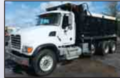
'02 MACK CV713 GRANITE

Tri-Axle Dump Truck , powered by Mack E7-460P, 460HP diesel engine and Maxitorque T318L, 18 speed transmission, equipped with 17'6" heated steel dump body with power tarp and (3) chutes, 2-spool plow hydraulics, rear spreader electric, 2-stage engine brake, camelback suspension, aluminum wheels, cruise control, air conditioning, 315/80R22.5 front tires, 11R22.5 lift tires, and 11R24.5 rear tires. In good condition with very good front and good rear tires. (Odometer Reads 834,023 Miles) (Meter Reads 33,687 Hours) (Unit# CR37)