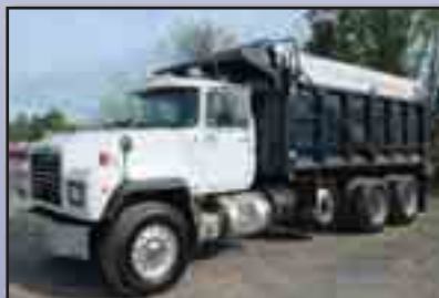
'02 MACK RD688S

Dump Truck , powered by Mack E7-400, 400HP diesel engine and Allison automatic transmission, equipped with Beau-Roc 17'6" heated steel dump body with tarp and 2-way gate, 44,000 lb rears, 16,540 lb front axle, 2-spool plow hydraulics, rear spreader electric, 2-stage engine brake, camelback suspension, aluminum wheels, cruise control, air conditioning, 315/80R22.5 front and lift tires, and 11R24.5 rear tires. In good condition with good tires. (Odometer Reads 335,678 Miles) (Meter Reads 16,154 Hours) (Unit# CR16)