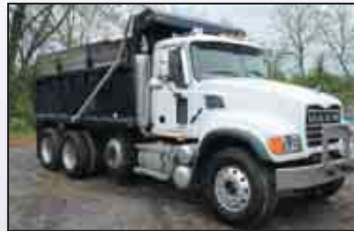
'05 MACK CV713 GRANITE

2005 MACK Model CV713 Granite Tri-Axle Dump Truck , powered by Mack ASET 370, 370HP diesel engine and Maxitorque ES, T310, 10 speed transmission, equipped with 15'6" steel dump body with power tarp and chute, 2-spool plow hydraulics, rear spreader electrics, 2-stage engine brake, camelback suspension, aluminum wheels, cruise control, air conditioning, 315/80R22.5 front and lift tires, and 11R24.5 rear tires. In good condition with good to very good tires. (Odometer Reads 513,761 Miles) (Meter Reads 25,167 Hours) (Unit# CR30)