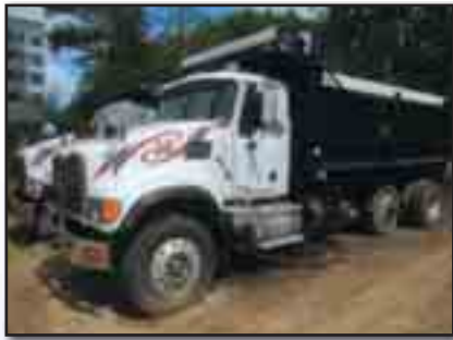
(2) '05 MACK CV713

2005 MACK Model CV713 Tri-Axle Dump Truck , powered by Mack (ReMack 2/21) AI-427, 427HP diesel engine and Mack T310M, 10 speed transmission, equipped with 16' heated steel dump body with chute, 2-spool front hydraulics, rear electrics, camelback suspension, aluminum wheels, 315/80R22.5 front and 11R24.5 rear tires. (Odometer Reads 432,996 Miles) (Meter Reads 21,602 Hours) (Cab