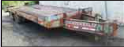
'96 INTERSTATE 20 TON

2003 GREAT DANE Model PS245, 45' Tandem Axle Flatbed Trailer , equipped with 45' x 96" deck, steel frame, (7) ratchet strap tiedowns, sliding tandems, spring suspension, and 11R22.5 tires. In good condition with good tires.