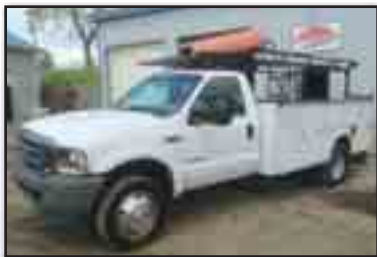
'02 FORD F-550XL SUPER DUTY

2002 FORD Model F-550XL Super Duty Utility Truck , powered by Powerstroke 7.3L diesel engine and automatic transmission, equipped with Knapheide 11' open utility body, gas air compressor, material rack, dual rear wheels, and 225/70R19.5 tires. In good condition with good tires. (Odometer Reads 110,982 Miles)