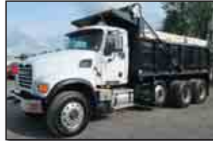
'02 MACK CV713 GRANITE

Tri-Axle Dump Truck , powered by Mack AI-427, 427HP diesel engine and Eaton Fuller 8LL, 10 speed transmission, equipped with BiBeau 17'6" heated steel dump body with power tarp and chute, 44,000 lb rears, 16,540 lb front axle, 20,000 lb lift axle, central hydraulics with single spool plow hydraulics and rear spreader hydraulics, 2-stage engine brake, camelback suspension, aluminum wheels, cruise control, air conditioning, 315/80R22.5 front and lift tires, and 11R24.5 rear tires. In good condition with good tires. (Odometer Reads 765,379 Miles) (Meter Reads 35,169 Hours) (Unit# CR26)