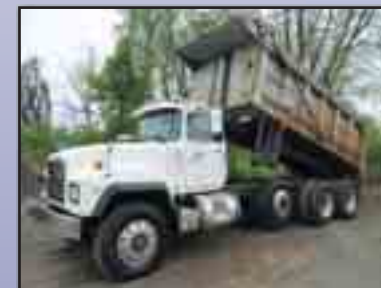
'00 MACK RD688S

Dump Truck , powered by Mack E7-400, 400HP diesel engine and Eaton Fuller 8LL, 10 speed transmission, equipped with BiBeau 17'6" heated steel dump body with power tarp and chute, central hydraulics with single spool plow and rear spreader hydraulics, 2-stage engine brake, camelback suspension, aluminum wheels, cruise control, air conditioning, and good tires. In good condition with good tires. (Odometer Reads 690,296 Miles) (Meter Reads 34,821 Hours) (Unit# CR28)