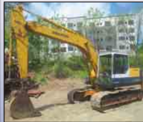
'91 KOMATSU PC150LC-5

condition with fair to good undercarriage. (Meter Reads 10,905 Hours)