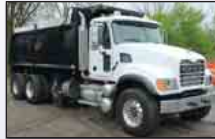
'02 MACK CV713 GRANITE

conditioning, 315/80R22.5 front and lift tires, and 11R24.5 rear tires. In good condition with very good tires. (Odometer Reads 791,343 Miles) (Meter Reads 30,947 Hours) (Newer Body) (Unit# CR36)