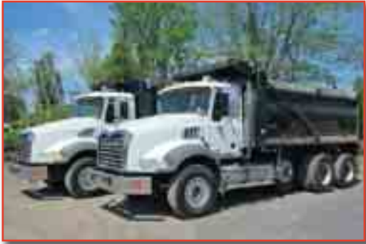
(2) '06 MACK CT713

PRE-SORTED FIRST CLASS MAIL US POSTAGE PAID UPPER DARBY, PA PERMIT #45