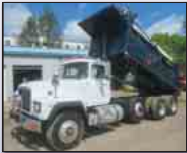
'99 MACK RD688S

1999 MACK Model RD688S Tri-Axle Dump Truck , powered by Mack E7-400 diesel engine and Maxitorque T2100B, 10 speed transmission, equipped with BiBeau 17'6" rock body with Hardox lined floor and walls, hi-lift gate, tarp, and chute, central hydraulics with single spool plow and rear spreader hydraulics, 2-stage engine brake, camelback suspension, aluminum wheels, cruise control, air conditioning, 315/80R22.5 front and 11R24.5 rear tires. (Odometer Reads 257,264 Miles) (Meter Reads 37,408 Hours) (Cracked Frame – Outer Rail Only) (Unit# CR24)