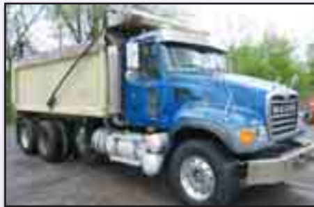
'07 MACK CV713 GRANITE

control, air conditioning, 315/80R22.5 front and lift tires, and 11R24.5 rear tires. In good condition with good tires. (Odometer Reads 750,419 Miles) (Meter Reads 30,946 Hours) (Newer Body) (Unit# CR39)