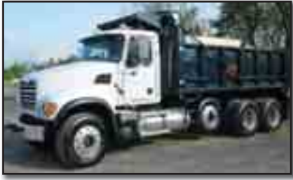
'04 MACK CV713 GRANITE

Tri-Axle Dump Truck , powered by Mack AI-400, 400HP diesel engine and Maxitorque ES, T310M, 10 speed transmission, equipped with Beau-Roc 17'6" heated steel dump body with 2-way tailgate, power tarp and chute, 46,000 lb rears, 16,540 lb front axle, 18,000 lb lift axle, central hydraulics with single spool plow hydraulics and rear spreader hydraulics, engine brake, camelback suspension, aluminum wheels, cruise control, air conditioning, 315/80R22.5 front and lift tires, and 11R24.5 rear tires. In good condition with very good tires. (Odometer Reads 604,263 Miles) (Meter Reads 33,115 Hours) (Unit# CR11)