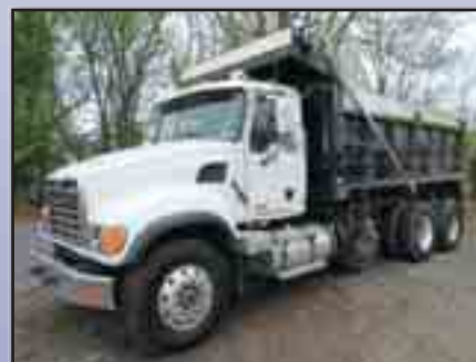
'04 MACK CV713 GRANITE

2005 MACK Model CV713 Granite Tri-Axle Dump Truck , powered by Mack AI-400, 400HP diesel engine and Eaton Fuller 8LL, 10 speed transmission, equipped with J&J 17"6" heated steel dump body with power tarp and chute, 46,000 lb rears, 16,540 lb front axle, 20,000 lb lift axle, 2-spool plow hydraulics, rear spreader electrics, 2-stage engine brake, camelback suspension, aluminum wheels, cruise control, 315/80R22.5 front and lift tires, and 11R24.5 rear tires. In good condition with very good tires. (Odometer Reads 309,543 Miles) (Meter Reads 19,880 Hours) (Unit# CR33)