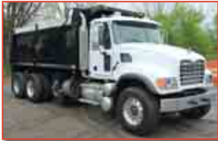
(1) OF (13) MACK CV713

1440 COWPATH RD. • HATFIELD, PA 19440 215/361-9099 • Fax: 215/361-9212 www.hunyady.com