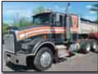
'89 KENWORTH T-800

1989 KENWORTH T-800 Tandem Axle Truck Tractor , powered by Cat 3406, 425HP diesel engine and Eaton Fuller 8LL, 10 speed transmission, equipped with 36" sleeper, wetline system, 38,000 lb rear axle, 12,000 lb front axle, single frame, air ride suspension, aluminum wheels, and air conditioning. In good condition with good tires. (Odometer Reads 547,983 Miles – Total Mileage 636,325)