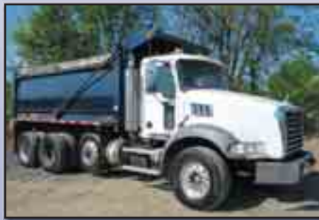
'06 MACK CT713 GRANITE

2006 MACK Model CT713 Granite Tri-Axle Dump Truck , powered by Mack (ReMack 6/18) AI-460, 460HP diesel engine and Eaton Fuller 13 speed transmission, equipped with Beau-Roc 17" heated steel dump body with power tarp and chute, setback front axle, central hydraulic with single spool plow hydraulics and rear spreader hydraulics, 2-stage engine brake, camelback suspension, aluminum wheels, power windows and locks, cruise control, air conditioning, 315/80R22.5 front and lift tires, and 11R24.5 rear tires. In good condition with very good front and good rear tires. (Odometer Reads 569,550 Miles) (Meter Reads 29,287 Hours) (10/18 Berygey Installed Reman Engine at 446,036 Miles/23,489 Hours) (Unit# CR12)