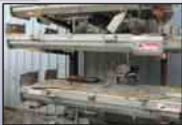
(22) STAINLESS STEEL SPREADERS

(22) Stainless Steel Tailgate Spreaders: (13) Electric Spreaders, with control boxes and (9) Hydraulic Spreaders (3) Cantilever Tailgate Spreader Racks (16) Snow Plow Light Frames (10) Snow Plow Pump Motors , 2-way