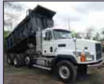
'00 MACK CL713