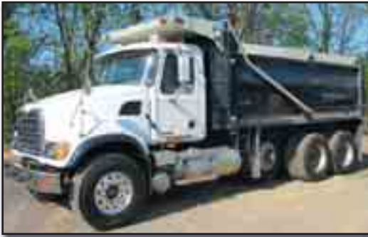
'07 MACK CV713 GRANITE

2007 MACK Model CV713 Granite Tri-Axle Dump Truck , powered by Mack AI-427, 427HP diesel engine and Allison automatic transmission, equipped with Beau-Roc 17"16" heated steel dump body with power tarp and chute, 2-spool plow hydraulics, rear spreader electrics, 2-stage engine brake, camelback suspension, aluminum wheels, power passenger window, cruise control, air conditioning, 315/80R22.5 front and lift tires, and 11R24.5 rear tires. In good condition with very good tires. (Odometer Reads 448,653 Miles) (Meter Reads 23,081 Hours) (New Power Tarp Motor) (Unit# CR32)