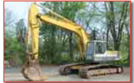
'92 KOMATSU PC220LC

PRE-SORTED FIRST CLASS MAIL US POSTAGE PAID UPPER DARBY, PA PERMIT #45